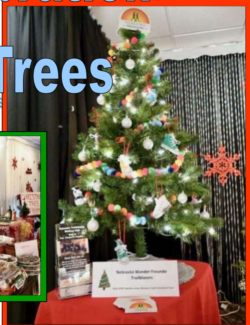
Trailblazer Tree—Thanks, Jill!!