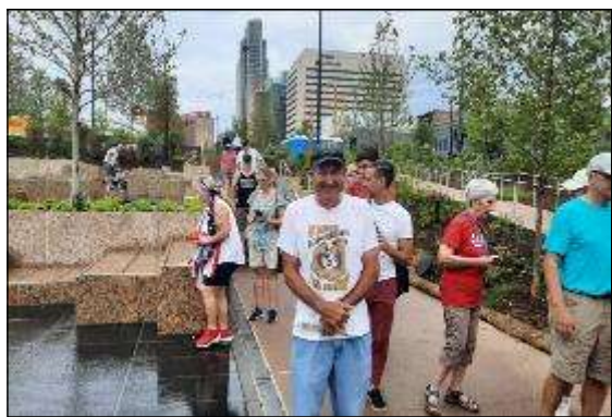
Group walk at the Cascades