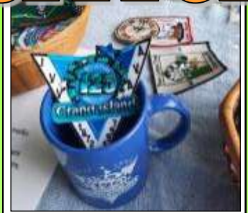
Special Grand Island Walk