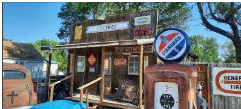
The rustic look