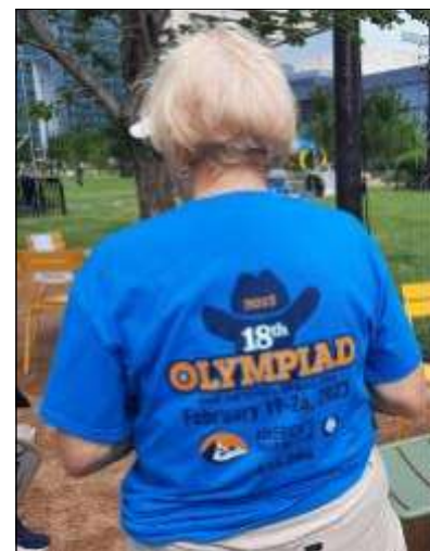
Advertising the Olympiad