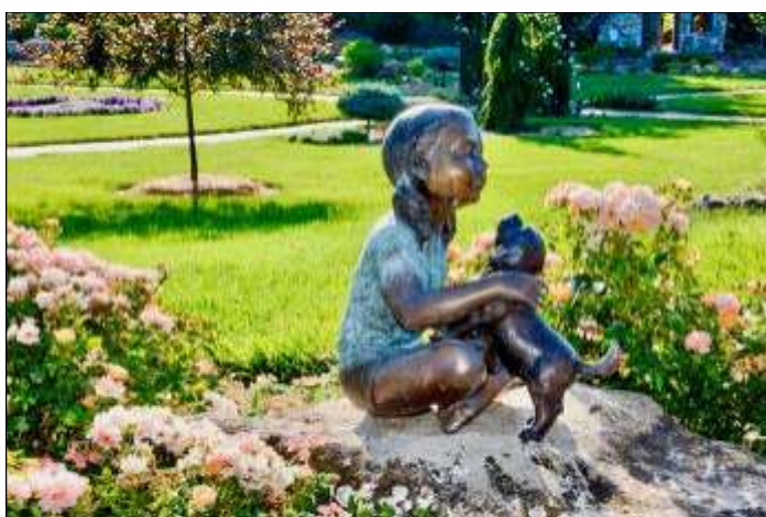
Cancer Memorial Garden