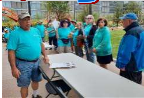
Volunteers all ready