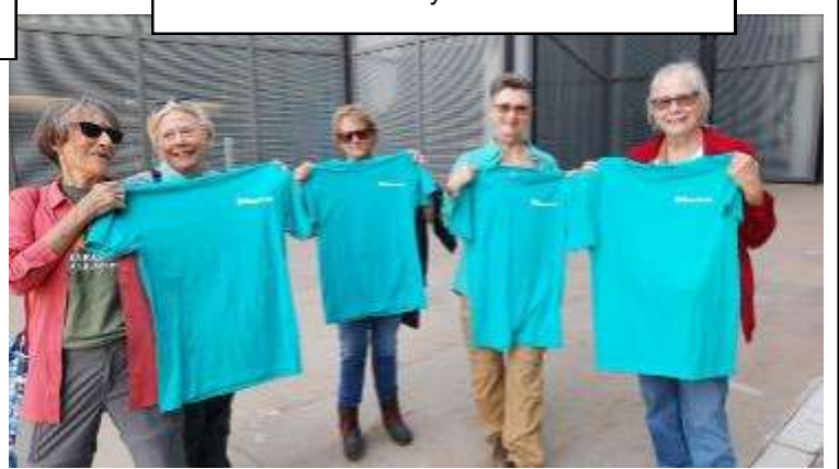
Volunteers with their Riverfront Shirts