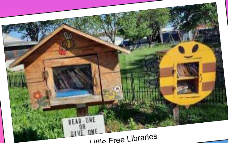
Little Free Libraries