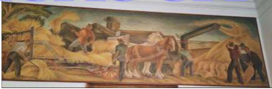
Post Office Mural