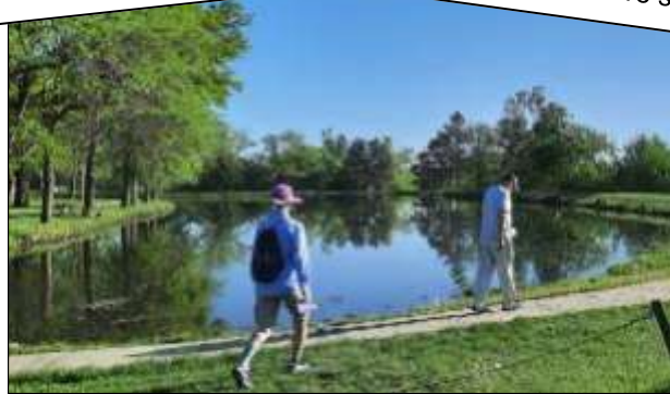
Walking around the pond