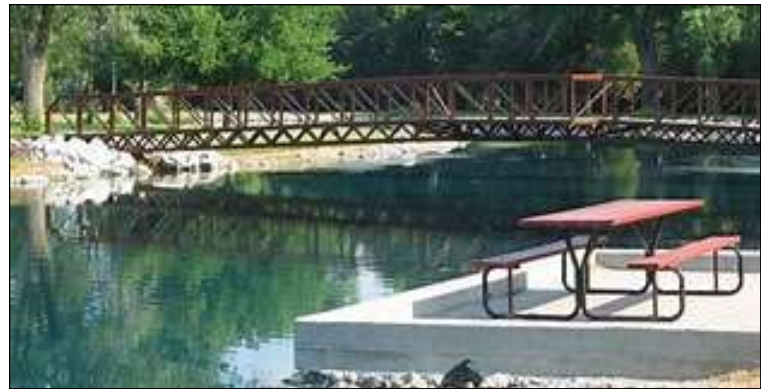
Humboldt Lake Park