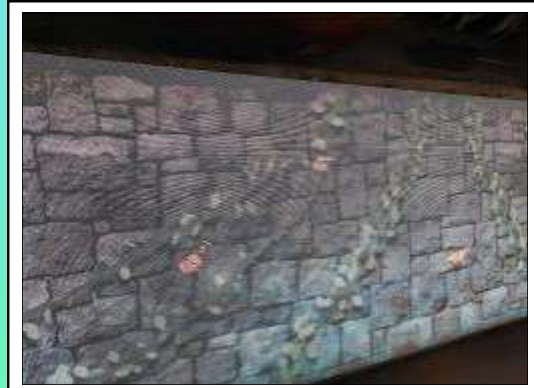
Butterflies fly across mural