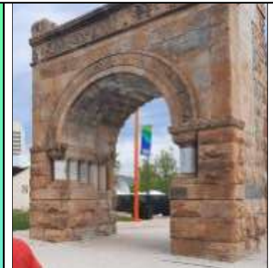
A little history remains