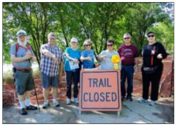
Boooo! Thumbs down to closed trails!!