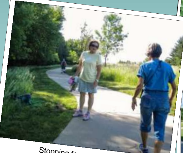
Stopping for a (dog) break