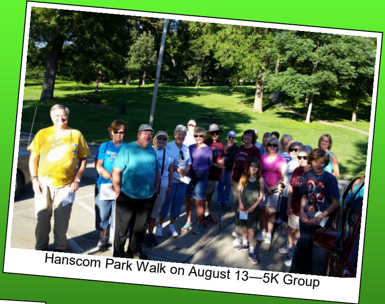
Hanscom Park Walk on August 13—5K Group