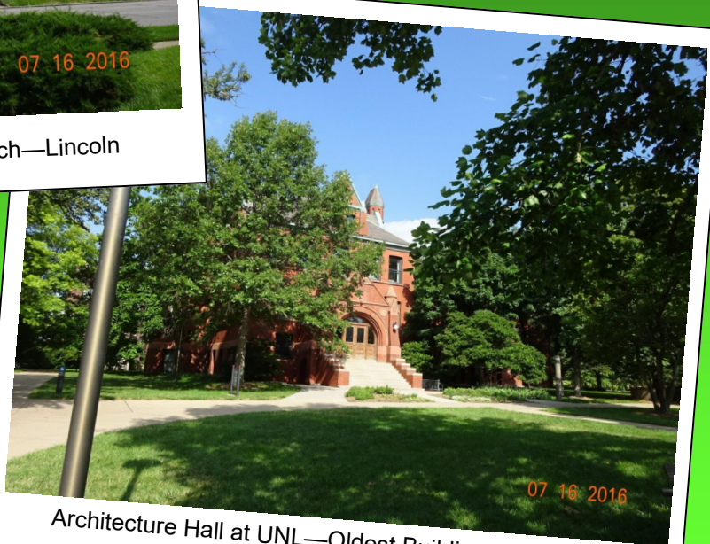
Architecture Hall at UNL—Oldest Building on Campus

For the latest on events and news visit our website: