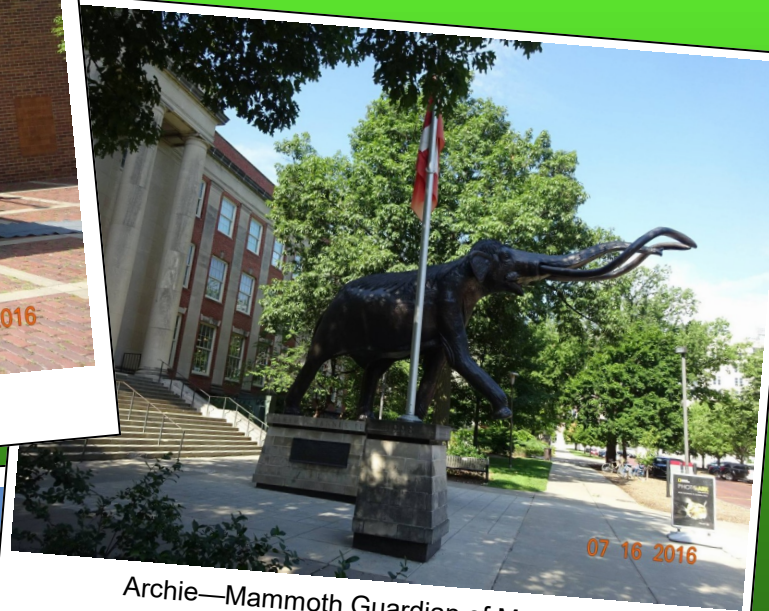
Archie—Mammoth Guardian of Morrill Hall