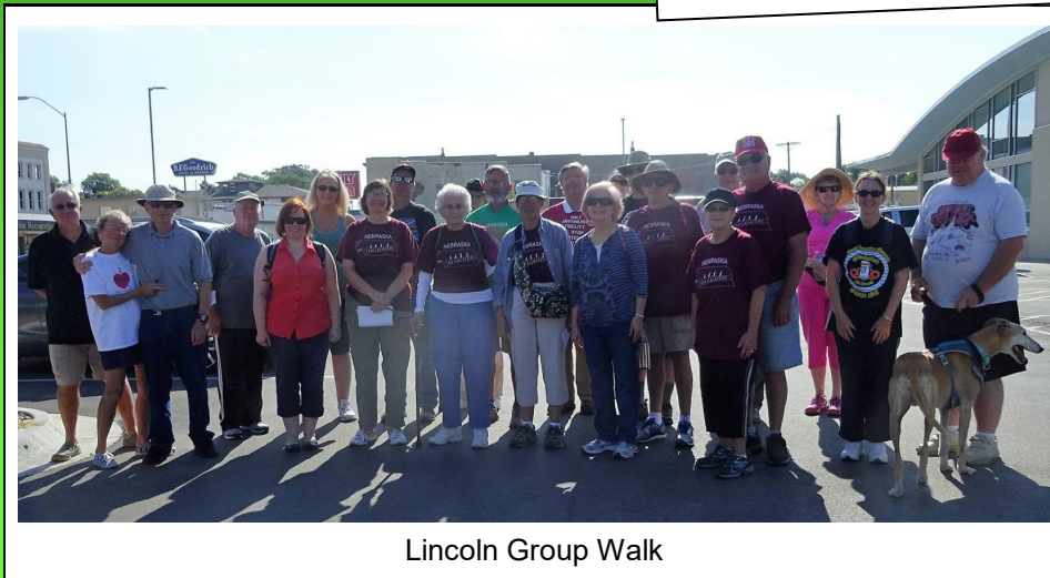
Lincoln Group Walk