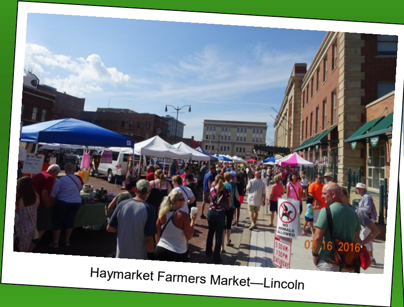
Haymarket Farmers Market—Lincoln